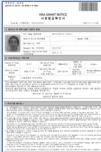
『 Visa 』

Clear copy of the personal information page