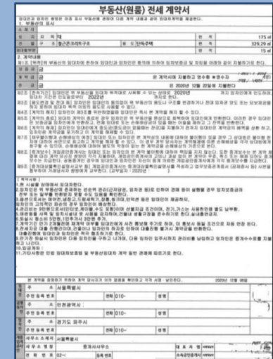
『 Proof of Residence 』

Certificate issued after your arrival in Korea